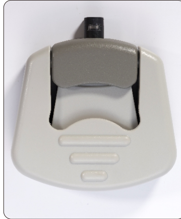
Wireless foot switch