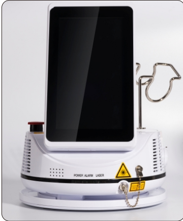
7 inch touch screen

GIGAALASER launch its second generation dental laser CHEESEII for the dental market in May, 2015, the max output power is 7w, 810nm or 10w, 940nm/ 980nm, there is a big color touch screen, wireless foot switch and customizable pre-setting protocols. As it is becoming more competitive in the dental laser market, our new CHEESEII laser system will offer our partners, dentists and hygienists an effective but affordable unit for their practice.